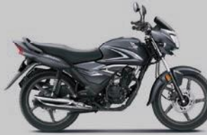
MATTE AXIS GREY