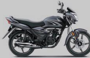
GENY GREY METALLIC